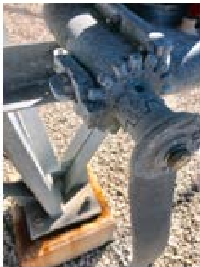
Close-up view of locking mechanism