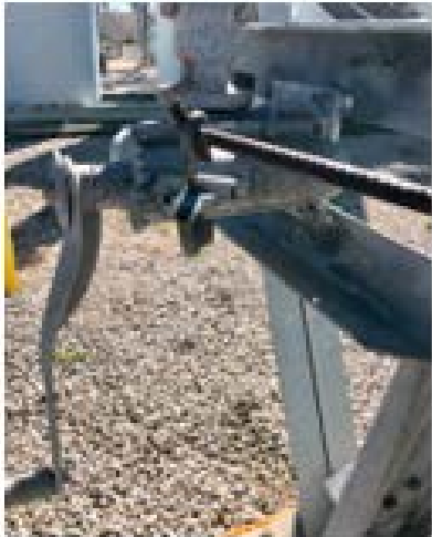
Remove the lock with the lifting tool